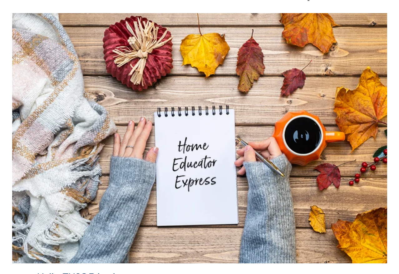
Hello, THSC Friend,